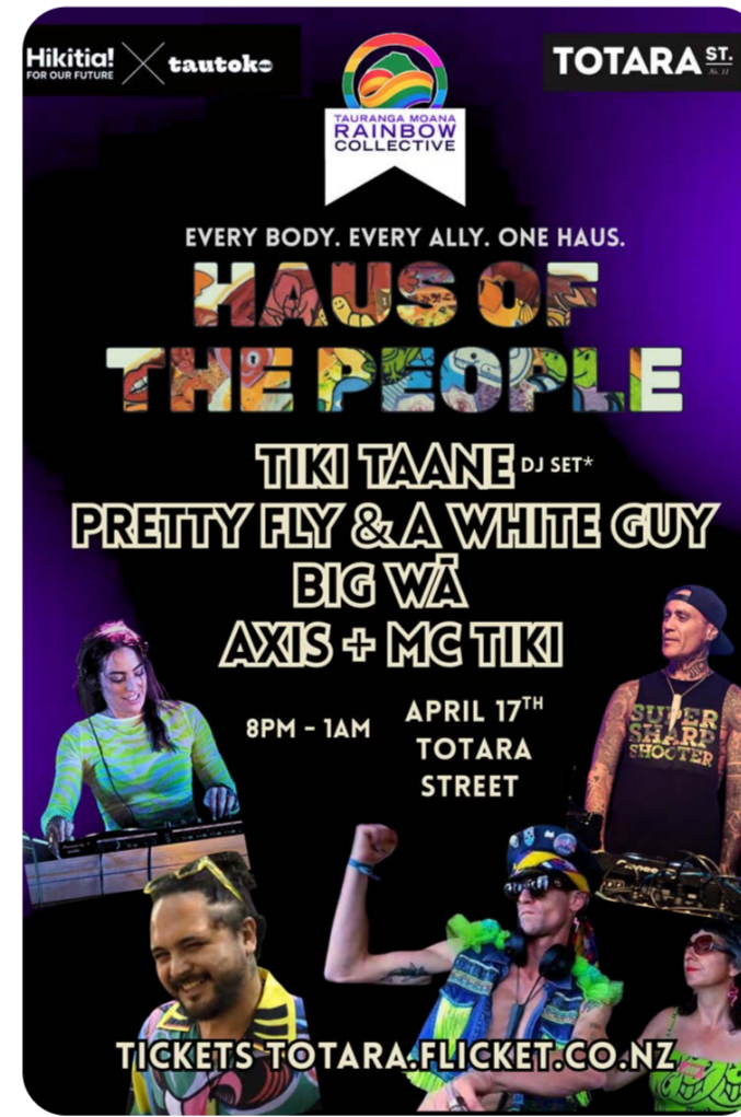
Haus of the People event poster.

The work is still in its early stages, but there are clear indicators of progress. Conversations have moved into planning, leadership has expressed commitment to next steps, and structures are beginning to form that support ongoing work. Prevention is starting to be seen as something that can be part of how these environments operate, rather than something separate.